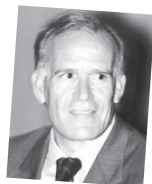
Victor Davis Hanson

Rhine/Moselle River Cruise: $10,500 per couple