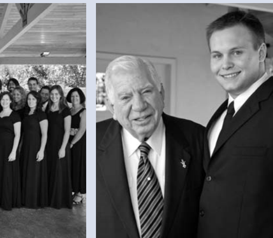
Top right: Former U.S. Senator Fred Thompson