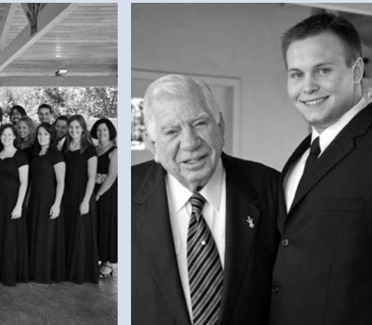
Top right: Former U.S. Senator Fred Thompson