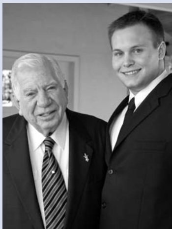
Top right: Former U.S. Senator Fred Thompson