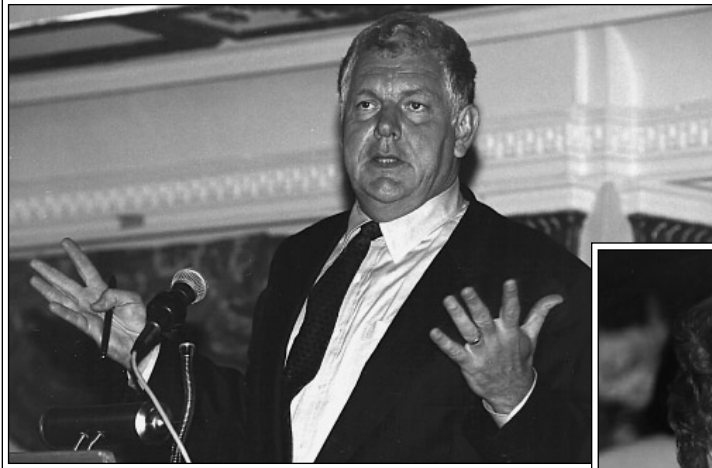
Former Secretary of Education Bill Bennett spoke about the vital connection between public virtue and the marketplace.

Hillsdale's Shavano Institute for National Leadership Seminar May 1996